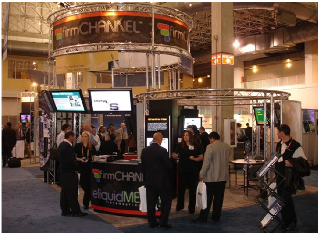
Above: eliquidMEDIA participated in the Digital Signage Expositions of 2007 (Chicago, IL) and 2008 (Las Vegas, NV)

Going forward, the company will continue their development of innovative solutions which deliver upon the needs of a rapidly evolving industry and consumer base.